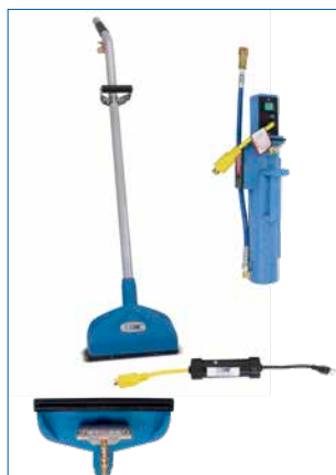
Part #: 705HR-TK