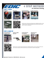
Laminated operation line card to mount on machine or on wall