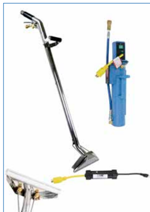
Part #: 705HR-GK