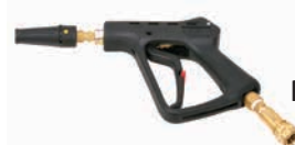
Durable High/Low Pressure Spray Gun