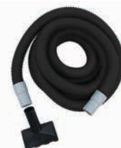
45' vacuum hose with gulper tool