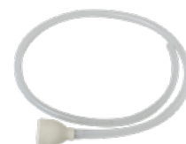
Sink fill adapter hose kit