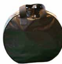
45' stretch exhaust hose with cuff, QuickDri tool and carrying bag