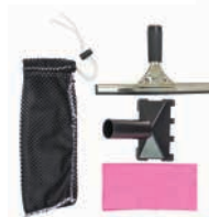
Mesh bag to carry mirror squeegee, microfiber cloth and other tools