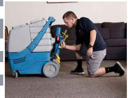
Heat ‘N’ Run External Heater 705HR