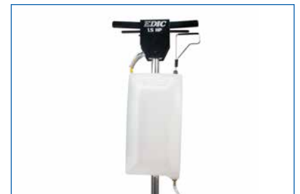
Optional 4 gallon shampoo tank

1.5HP 66 Frame Motor with Triple Planetary Gears